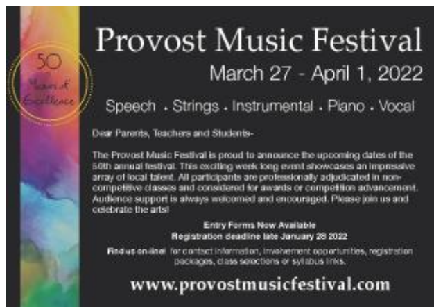
1 - Provost Music Fest