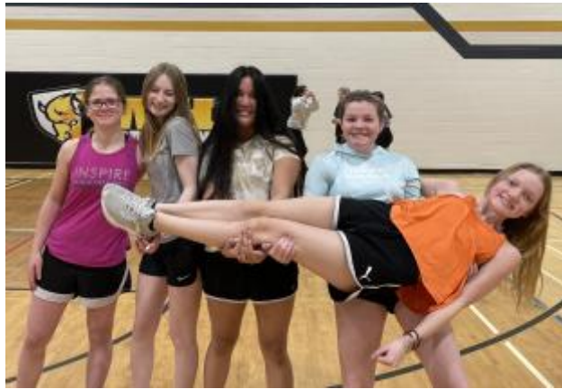
Phys Ed 8 - 5 km run!