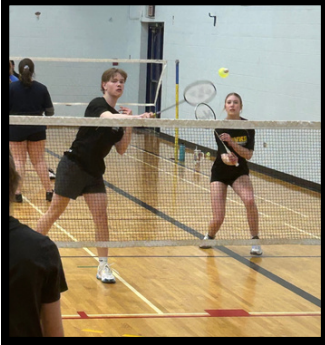
Time for Badminton & our Annual Dodgeball Tournament!