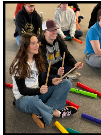
Our teachers are very creative!

Our spring Student Success Meeting were held from 4:30-7:30pm on March 19th in the gymnasium. Our foods class made fresh donuts, apple and cherry strudel & fresh coffee was served. We also had our Spirit Wear available for our families to purchase. It was a great evening and we thank all those who attended, we had approximately 70 people come through that evening. If you are wanting to connect with your child's teacher, we are having on-line Student Success Meetings on April 10 th - please see our website to sign up. Below are some of the students preparing the desserts. They did a great job and it was delicious!